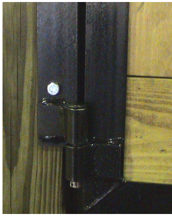
Inside Mount Hinge Closeup