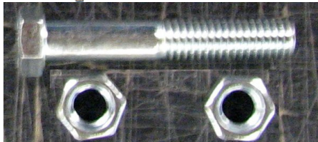
Bottom Stay Roller Bolts and Nuts 3/8" x 2 1/4" bolt and 2 each 3/8" nuts One Bolt and 2 nuts included in hardware kit