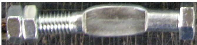
Upper Trolley Roller Bolt and Nuts Assembly Two Bolt and Nut Sets included in each hardware kit